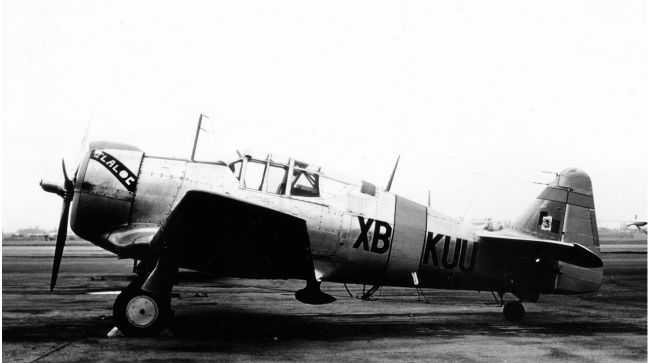
North American P-64 XB-KUU (C/N 68-3062, ex USAAF 41-19085), photographed at Mexico City sometime in the mid 50s.

Unfortunately, the book has been out of print for several years and the few copies available are used ones that appear every once in a while at online auction websites like Mercado Libre or Ebay. So, if one of these days you spot one, don't hesitate and buy it right away!