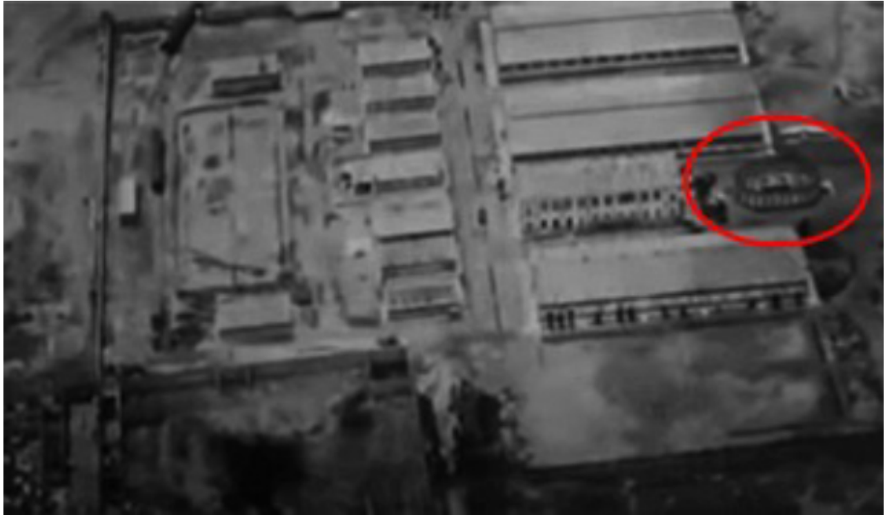
Nice aerial view of the TNCA workshops and the mysterious round building.

This curious round facility stood sentinel before the TNCA's administration building, a silent witness to the comings and goings of the airplane factory's daily operations. Yet, its purpose, at least to an uninitiated like me, has remained a mystery.